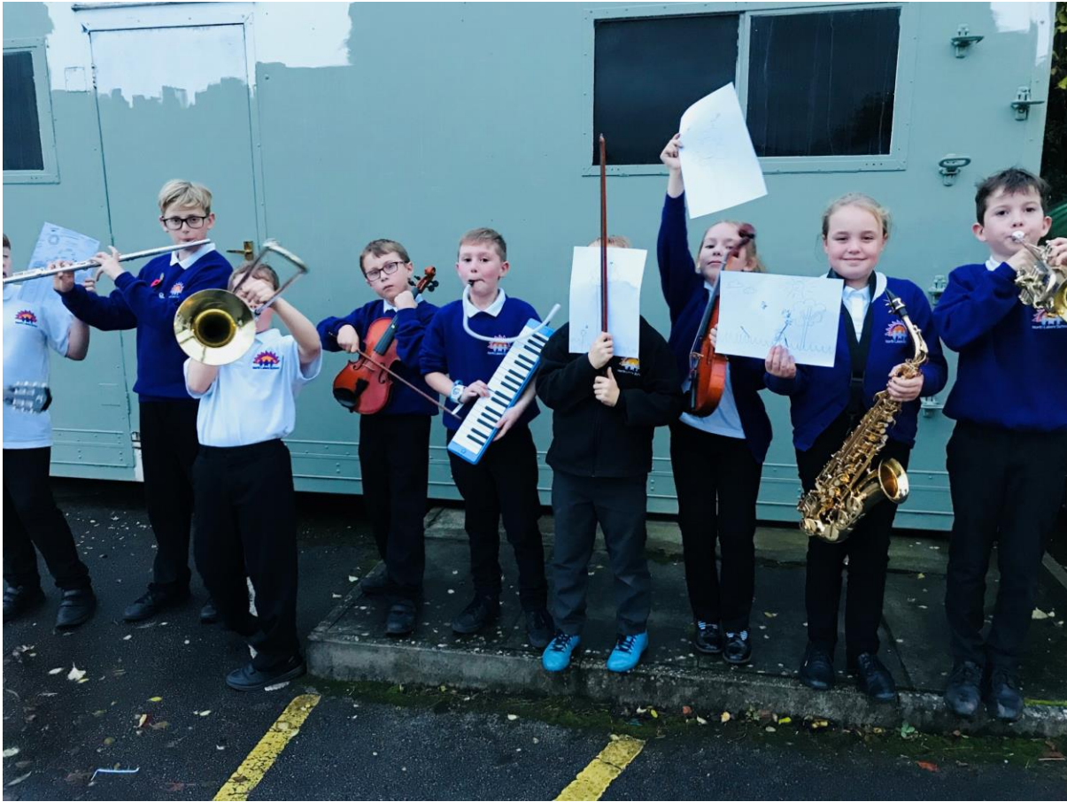
North Lakes School's Orchestra of Variety using the youth portacabin being painted by Blue Jam